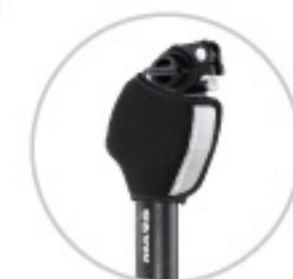
Protective cover with reflective strip.